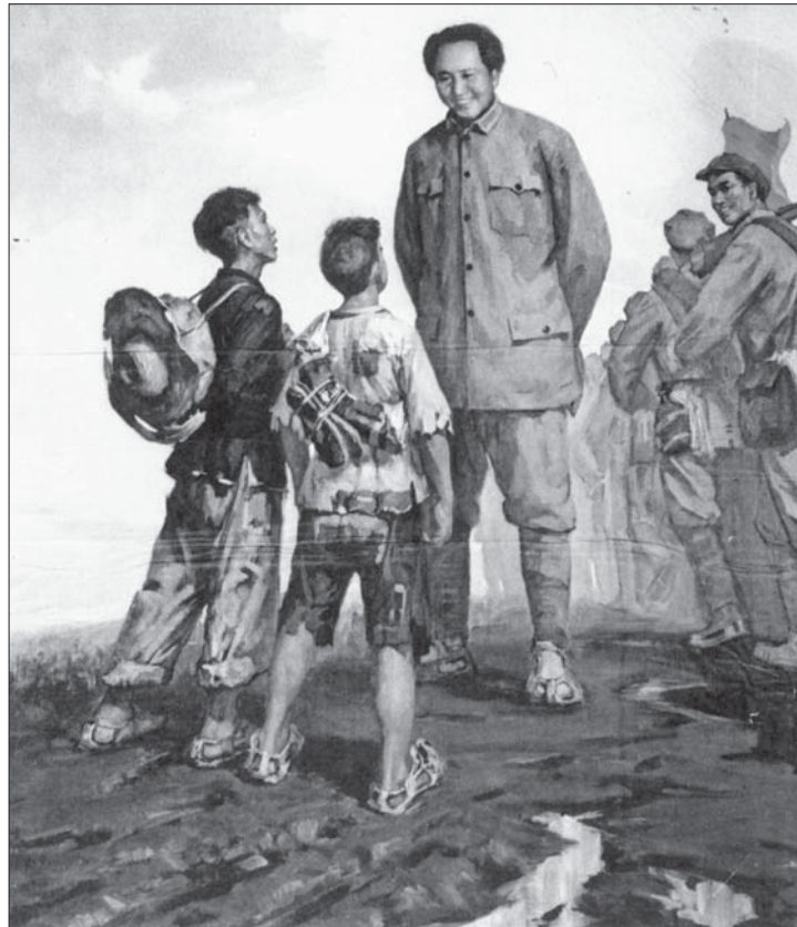
Source: Cai Liang, Peasant sons , 65 × 52 cm; from Lincoln Cushing and Ann Tompkins, Chinese Posters, Art from the Great Proletarian Cultural Revolution , Chronicle Books, San Francisco, 2007, p. 93 Digital image courtesy of Lincoln Cushing/Docs Populi.