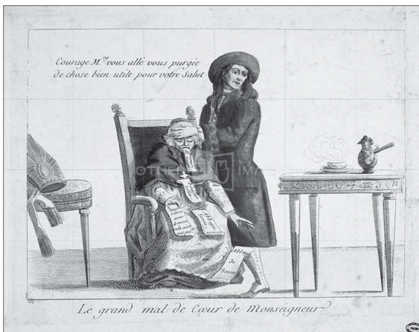
A French engraving

Source: Le grand mal de Cœur de Monseigneur ('The Great Heartbreak of Monsignor'), 1789; from www.outrasimagens.com Bibliothèque nationale de France